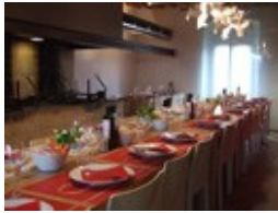
Officina della Bistecca www.solociccia.it

At 12,00 Light lunch will be organize in a butchery in the Panzano in Chianti, a fantastic experience at Macelleria Cecchini Dario