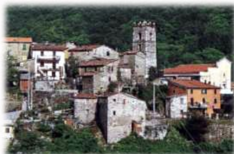
Village of Colonnata